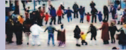
Aspen's Ute Gratitude Snowdance

Watch a Whale of a Tale about Gratitude: www.youtube.com/watch?v=O3ebarLje9U www.snopes.com/photos/animals/whalethanks.asp